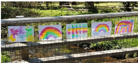
Children's rainbows on Clunton bridge

We are so lucky to have so many willing people going above and beyond in these extraordinary times. Throughout the Parish we clap, rattle our pans and bang our wheelie bin lids every Thursday at 8pm to thank each and every one of you.