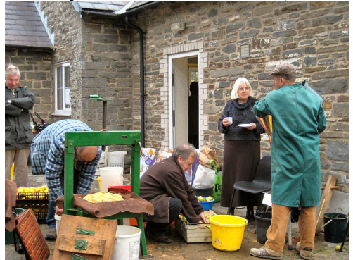
Apple pressing at Clunton