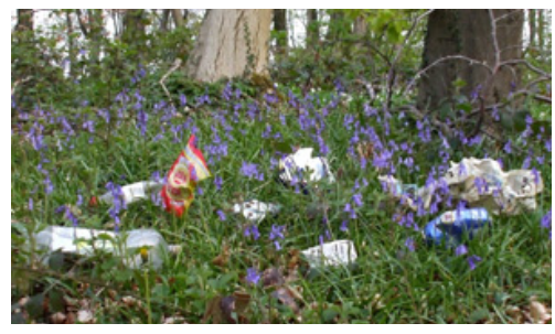
Litter degrades our environment

volunteers to contact him on 660192 or email j.hoskins@which.net Litter picking would probably take place in the Spring.