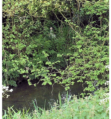
Spot the goose

Sit on the commemorative bench by the T Bridge at Kempton, look across the Kemp, and there, amongst trunks of alder and stems of nettle, squats a pure white goose. It arrived (swam, blew in, flew in, waddled there) some time in April. On the first perhaps?