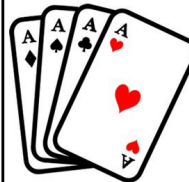
Table Tennis, Darts, Dominoes, Cards, Table Games

Tea and coffee available or bring your own drinks