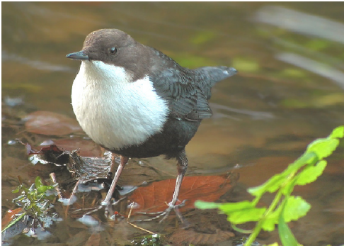
Dipper ( Cinclus cinclus )

Vince Downs talked of the successful work undertaken to provide secure nesting sites for Dippers, which are doing well at present, with nests under a number of local bridges.