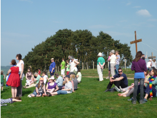
On the top of Clunbury Hill

Serving Beambridge, Clunbury, Clunton, Coston, Cwm, Kempton, Little Brampton, Obley, Purslow, The Llan and Twitchen