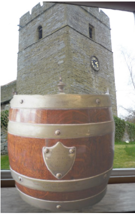
The barrel back in Clunbury