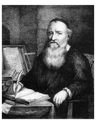
Menno Simons the most famous leader of the Mennonites

as fellow believers but would only work together with them in areas