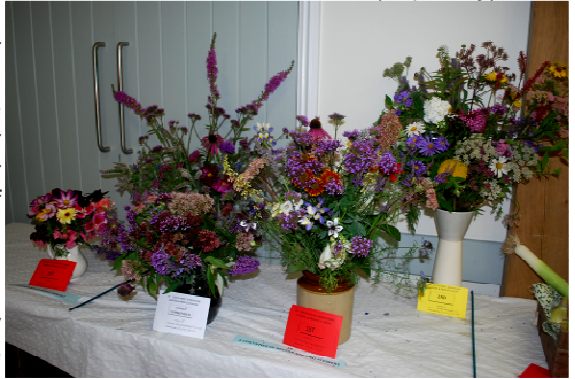
Prizewinning floral displays