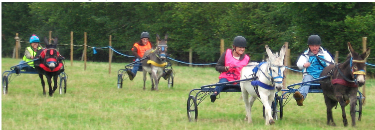
A fight for first place in the Donkey Derby

The Dog Show and the Gymkhana were much enjoyed by the participants and those watching. New this year, the Donkey Derby, proved to be a very exciting and popular attraction