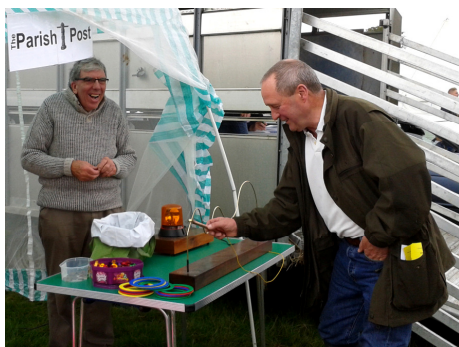
A steady hand at The Parish Post stand

Many thanks to all the people who work tirelessly every year to make sure the Show continues for us all to enjoy. If you weren't there this year save the date for next – 29 August 2016!