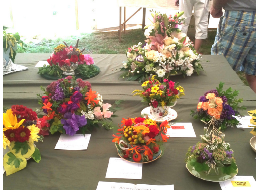
Some entries in Class16 'An arrangement in a cup and saucer'.