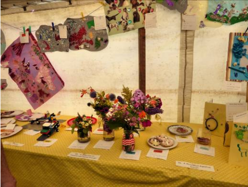
Some of the children's entries in the Show Tent