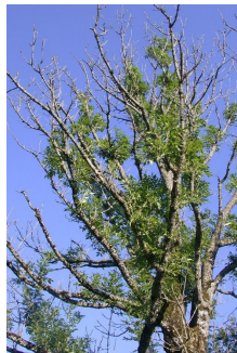
Ash with Dieback

A proportion of these infected and weakened trees will pose safety risks, especially if they are next to a busy road, public pathway, school or community grounds.