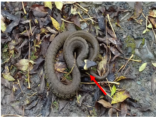
Grass Snake, note the diagnostic yellow collar