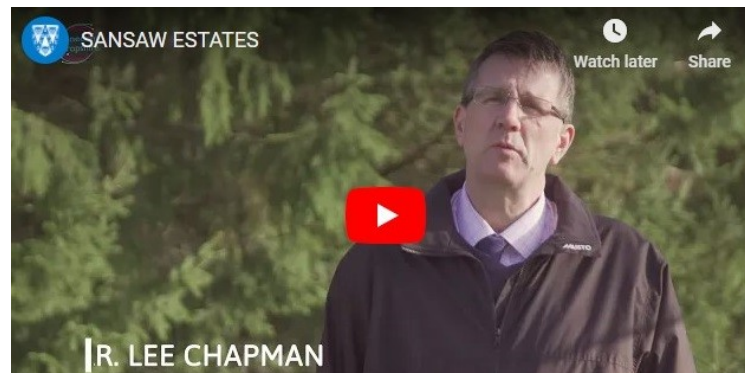
Sansaw Estates received a £60,000 grant from the Scheme

Eligible businesses could qualify for a £25,000 grant each to 100% fund access to a high-speed broadband connection.