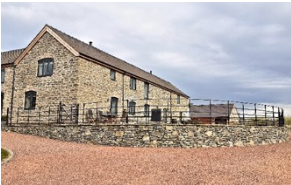
Barn conversions 2021

In 1939 there were 35 households, a further 13 households (including the barn conversions) have been added (either new buildings or re-purposed existing buildings), all over the last 50 or so years. Currently one property is unoccupied and four are second homes – a new phenomenon.