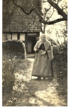
Outside 25 Kempton Circa 1900