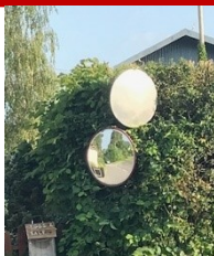
The mirrors after cleaning; (top mirror still unusable)