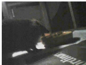
Hedgehog caught partying at night by the camera