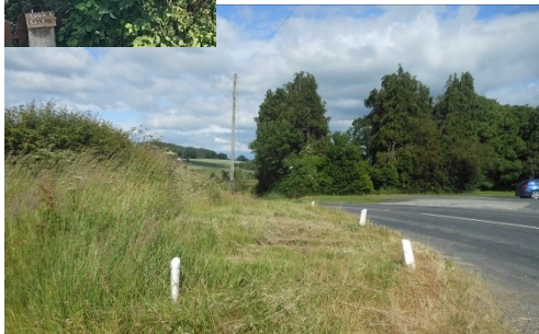
Below right the view to the right after cutting.