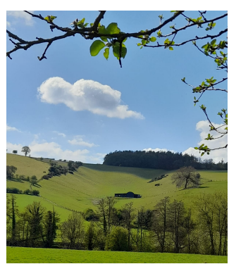
Hector Lyttle View of Merry Hill from Kempton