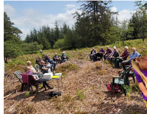
Picnic on Whinberry Hill (see inside)